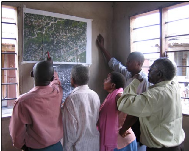
Focus group discussion in Stakishari

A further milestone for the project was the second workshop held at the Court Yard Hotel in Dar es Salaam on the 2 nd and 3 rd of October 2006. The "Consultative Workshop on Trunk Infrastructure and Urban Growth in Dar es Salaam" was targeted at the key institutions involved in the urban development process of the city. During the morning session of the first day preliminary findings of the fieldworks undertaken were presented in order to get feedback